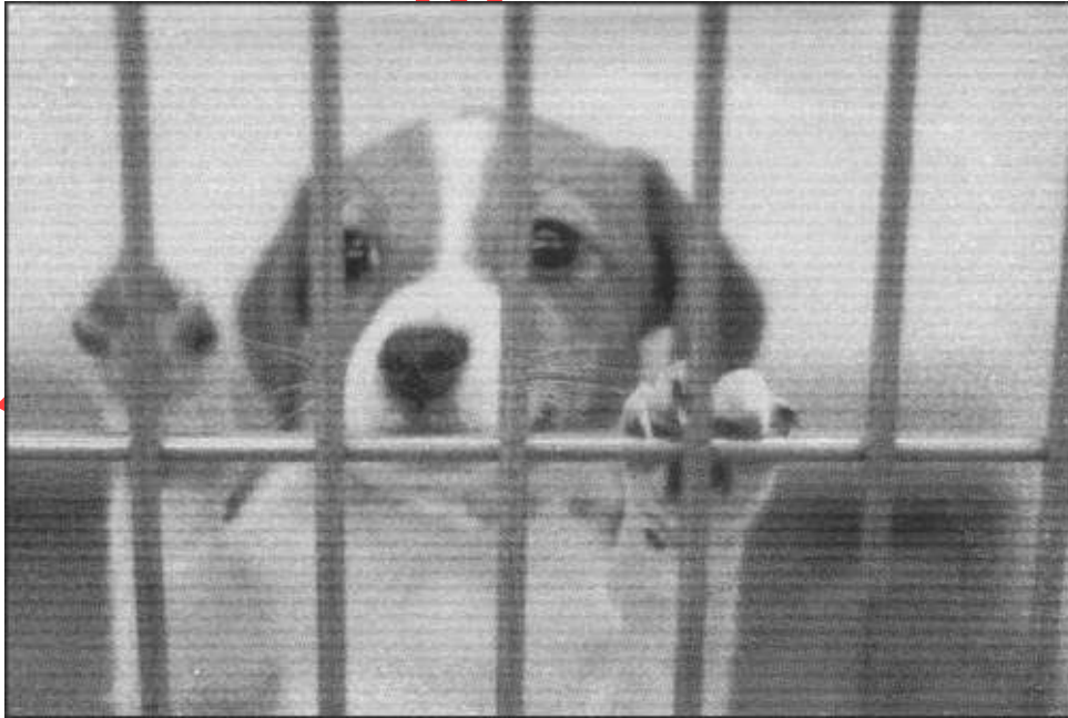
A Puppy in a Kennel